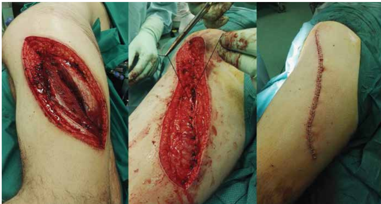
Figure 3. Laceration wound caused by a ski injury. Total vastus lateralis muscle tear in 19 years old guy.

The treatment of the myositis ossificans is conservative first. A few studies showed that the majority of the patients treated with specific rehabilitation protocol return to sport at the same level before the injury, even if the rehabilitation process is longer than an isolated muscle injury (44,45). When calcifications, instead, cause pain and functional impairment, the majority of authors agree on their surgical removal. Surgical exeresis of a calcification should be performed 12 to 24 months after the end of the pathogenetic process. Commonly, an open procedure is performed, although some authors described the arthroscopic exeresis in case of calcifications at the rectus femoris insertion (46). Recently, Orava et al. (47) reported good to excellent results in more than 80% high-level athletes who underwent the exeresis of calcifications at the proximal third of their hamstrings. In these cases, the surgical exploration and neurolysis of the sciatic nerve is essential because it be trapped by scar tissue and be a source of pain.