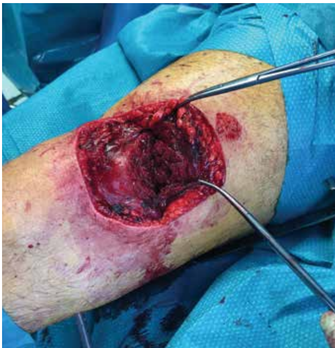
Figure 1. Complete cutting wound of the rectus femoris, vastus intermedius, and partial tear of the vastus lateralis following a ski downfall.

The suture of a muscular belly is technically demanding because muscular tissue has unique characteristics. First, the suture is more difficult because of the low resistance of the muscle tissue, which determines a high rate of fail-